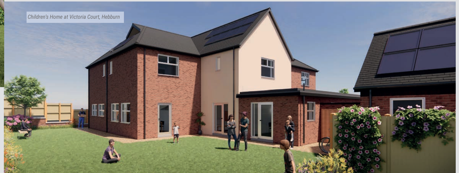
Children's Home at Victoria Court, Hebburn