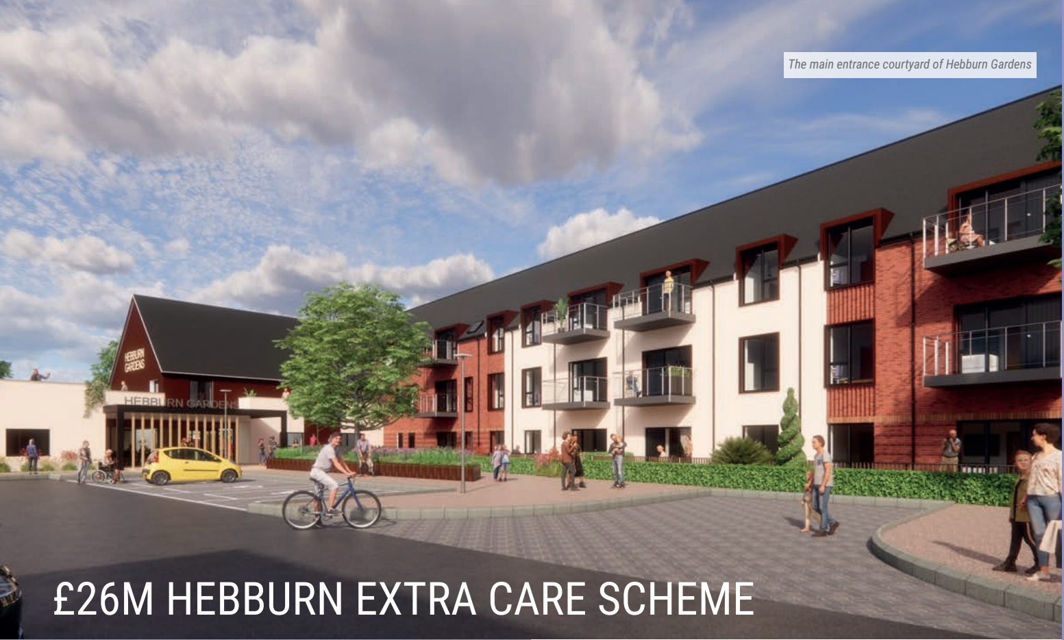
The main entrance courtyard of Hebburn Gardens