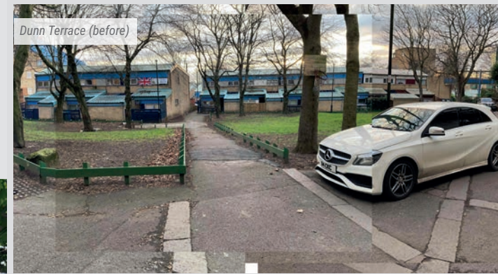
Dunn Terrace (before)

"Dunn Terrace will also be the first neighbourhood to benefit from other improvements including increased play provision for children and young people, fencing replacement and tree management. We've invited all customers living in this area to give us their views and feedback on the proposed designs for their neighbourhood."