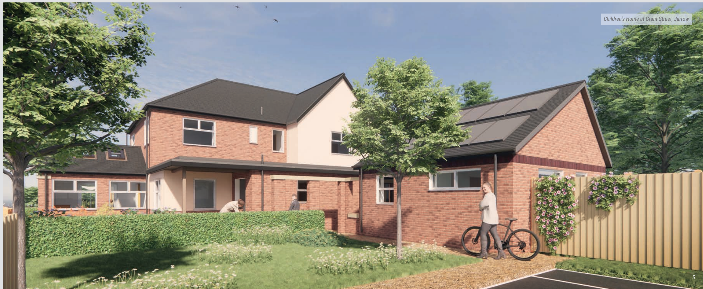
Children's Home at Grant Street, Jarrow