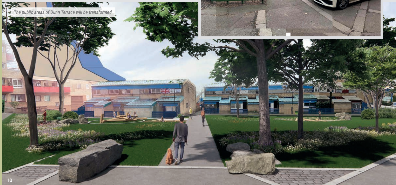
The public areas of Dunn Terrace will be transformed

BCT worked with ourselves on the wider consultation and we have developed a master plan for the area which includes proposals that are affordable, meet the investment priorities and are delivered in line with the estate's Grade II* listing. Representatives from Historic England and conservation and planning officers from Newcastle City Council have also been involved throughout the process.