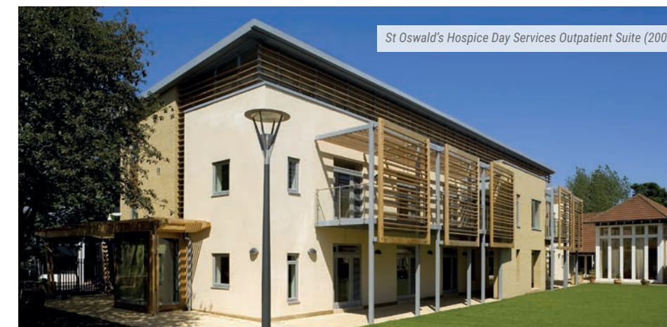
St Oswald's Hospice Day Services Outpatient Suite (2009)