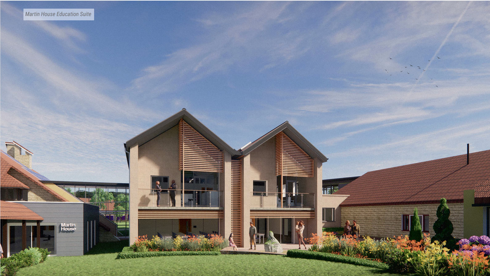
Martin House Education Suite

"As the whole construction is to be phased and carried out within a live site, requiring both staff and patients to be decanted within the existing building, it's going to be a challenging scheme but the end result will be worth the period of disruption."