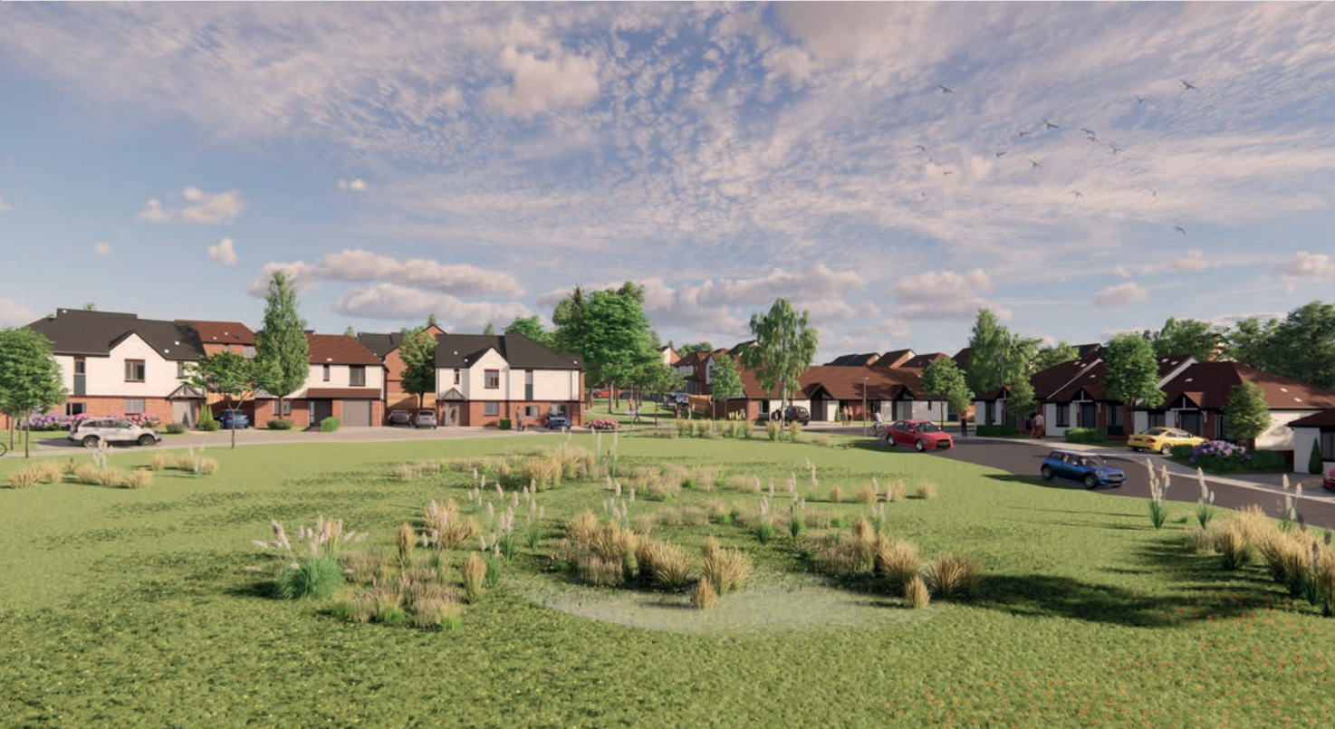
Proposed streetscape at Bevan Square, Murton