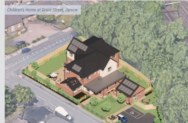
Children's Home at Grant Street, Jarrow

"The approval of these planning applications is a welcome step towards improving outcomes for the children in our care, and a key part of our commitment to our young people."