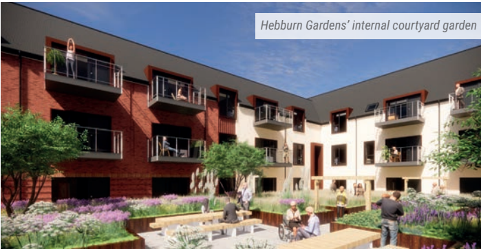
Hebburn Gardens' internal courtyard garden

The Hebburn scheme is the first of three Karbon Homes projects to provide much-needed, specialist Extra Care accommodation across South Tyneside over the next six years and will remodel the expectation of extra care, which is typically aimed at older adults who require support to live independently.