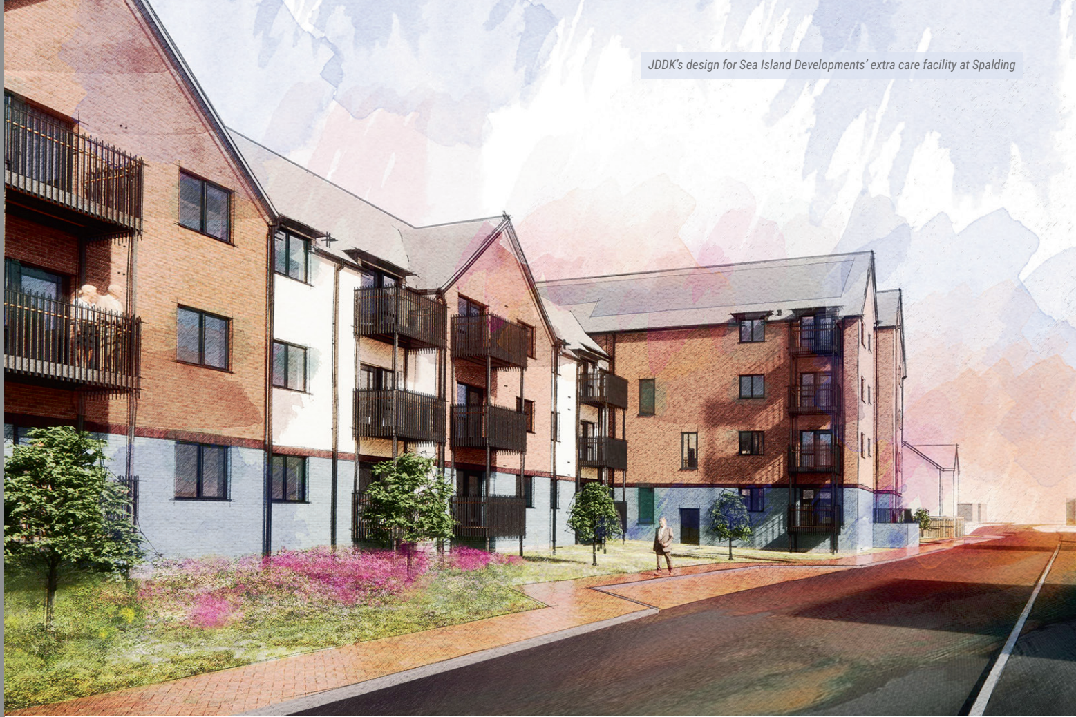
JDDK's design for Sea Island Developments' extra care facility at Spalding