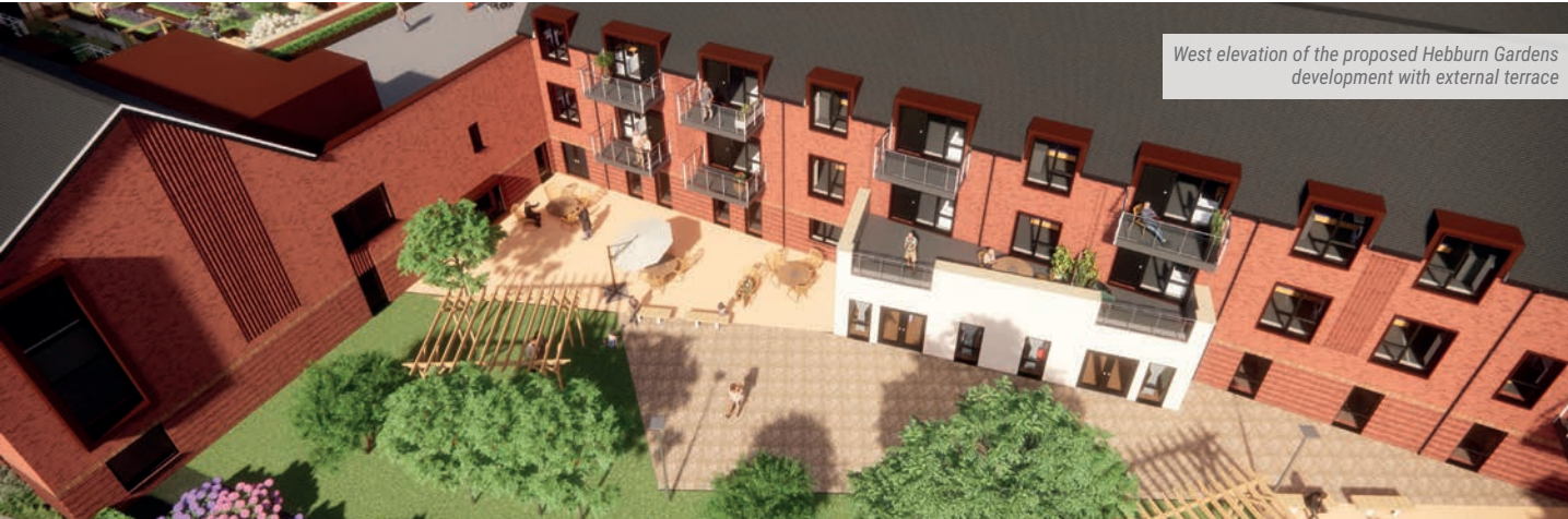
West elevation of the proposed Hebburn Gardens development with external terrace