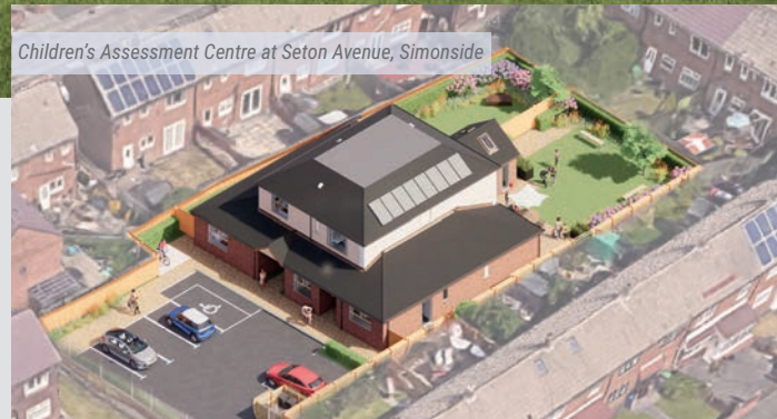
Children's Assessment Centre at Seton Avenue, Simonside