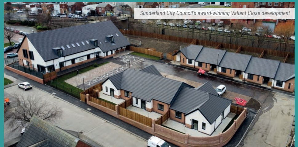
Sunderland City Council's award-winning Valiant Close development

The new bungalows, which will be managed by NDRC, have been designed externally to blend in with the traditional scale and form of the neighbouring housing in Hendon but with a contemporary twist.