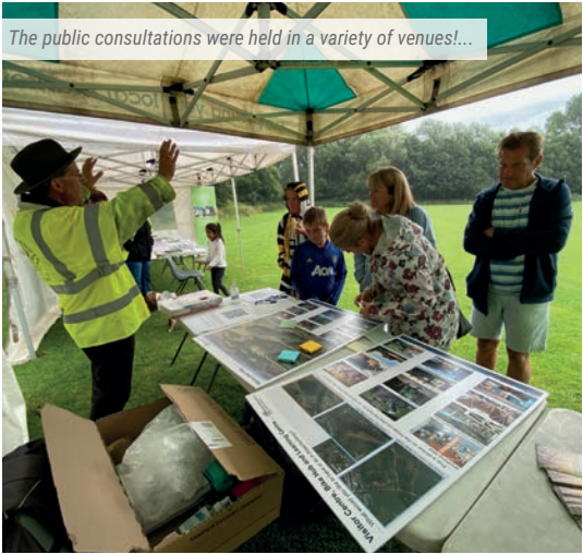
The public consultations were held in a variety of venues!...