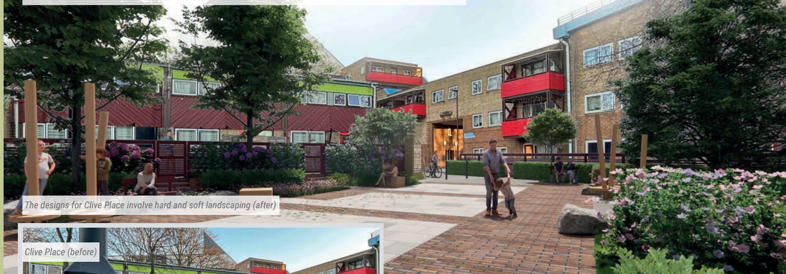
The designs for Clive Place involve hard and soft landscaping (after)