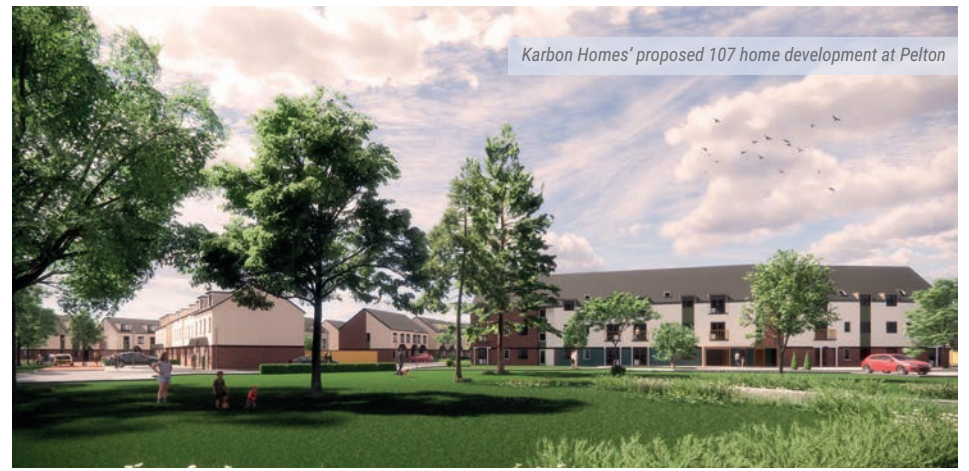
Karbon Homes' proposed 107 home development at Pelton