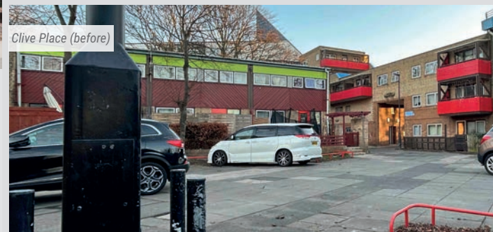
Clive Place (before)

In the Spring 2019 issue of Millmount News, we outlined our work for the Byker Community Trust (BCT), now part of Karbon Homes. The project involved the design of environmental improvements to a pilot area after meeting a Steering Group of tenants to gain insight on the environmental issues affecting the Estate and their preferred options to resolve these.