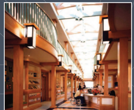
The Pioneering Care Partnership Centre at Newton Aycliffe completed in 1999 provides a base to support vulnerable people in the community.