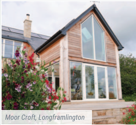
Moor Croft, Longframlington