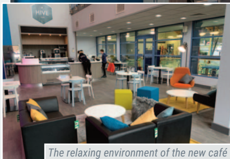
The relaxing environment of the new café

refurbished and equipment renewed with state-of-the-art interactive machines, utilising large format digital projectors and colour-change LED lighting to provide a fully "immersive experience"; with the final result being an attractive and innovative solution, to provide a gym to rival the current private gym competitors.