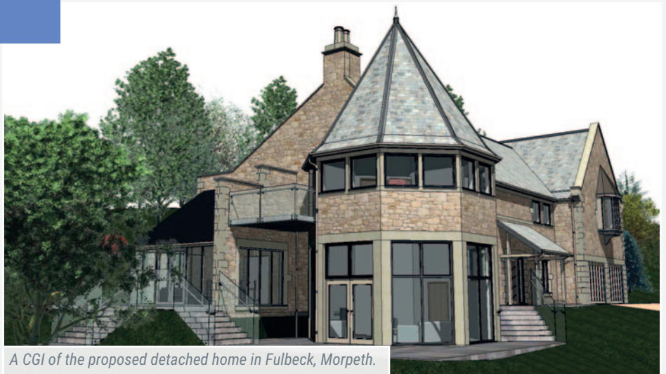
A CGI of the proposed detached home in Fulbeck, Morpeth.

The design is dominated by the octagonal two storey corner ‘Dovecote’ structure on which the remainder of the house pivots and which provides a stunning extra height lounge with the master bedroom above it also enjoying a private balcony. A double height entrance hall is overlooked by a minstrel gallery to the first floor, off which the four bedrooms and family bathroom are accessed. The ground floor includes an integral double garage with workshop area, home office, open plan kitchen and a separate sunroom/dining area.