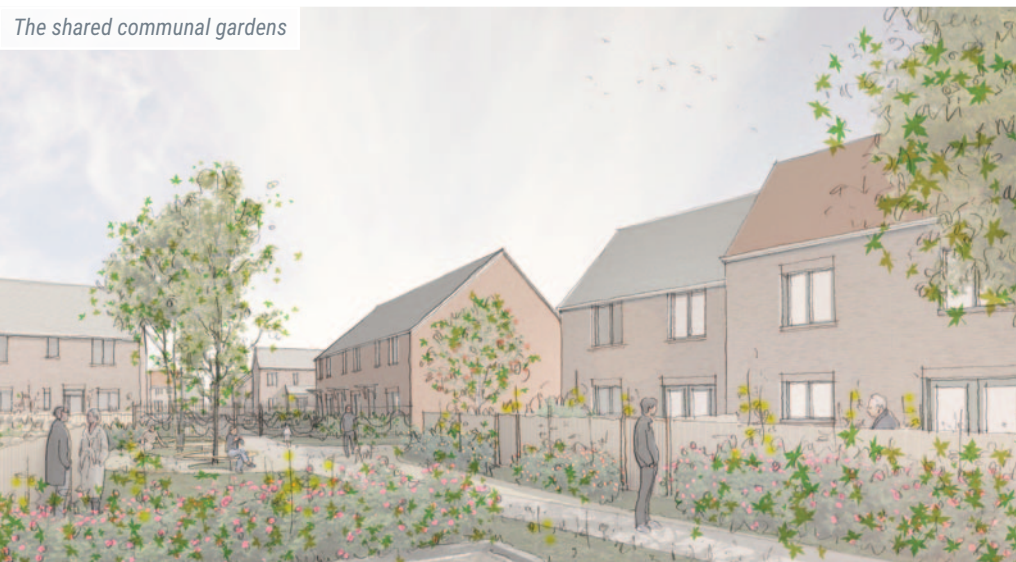
The shared communal gardens

This is a live project running in parallel to a research project funded by the Wellcome Trust between the School and the NHS to determine the effect of the built environment on agitation levels in people living with dementia.