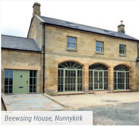
Bewsing House, Nunnykirk