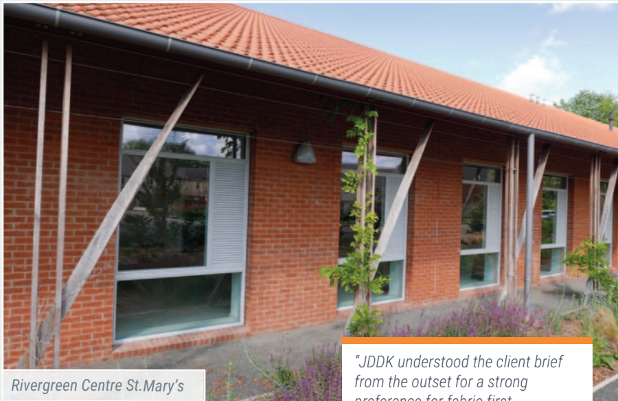
Rivergreen Centre St. Mary's

The timber frame home's insulation, triple glazing and airtight measures all minimise the space heating demand, and a Mechanical Heat Recovery and Ventilation system provides fresh air throughout. Heat is provided by a Ground Source Heat Pump and Photovoltaic Panels generate almost all of the home's electricity needs.