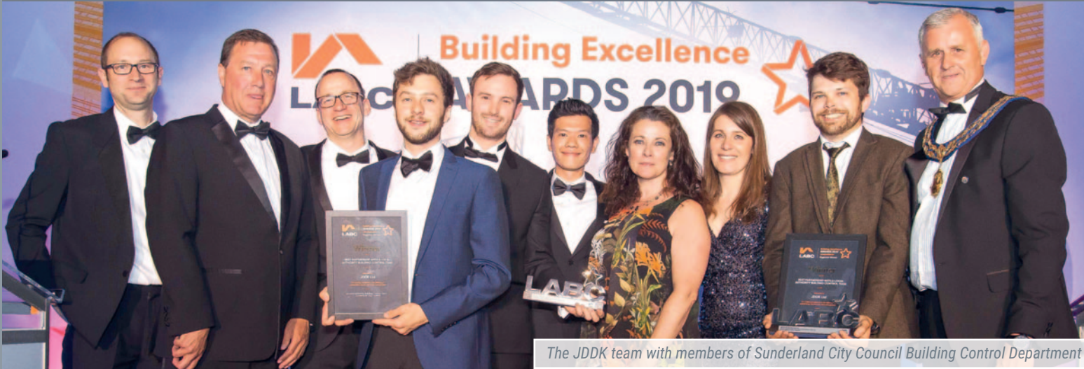
The JDDK team with members of Sunderland City Council Building Control Department

Our partnership with the Building Control Department of Sunderland City Council won a prestigious LABC (Local Authority Building Control) Building Excellence Award as the Best Partnership at the NE regional LABC Awards on Friday 5th July.