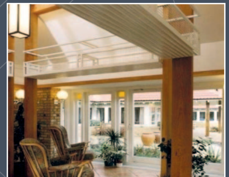
Marie Curie Centre in Newcastle upon Tyne, a hospice designed to feel like a comfortable country house whilst offering the most advanced techniques in palliative care, completed in 1995