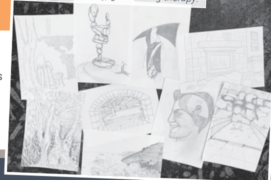
ABS TimeToSketch.jpg Sketching therapy!

The Architects Benevolent Society is a charity dedicated to supporting those working in the wider architectural professions and their families in times of need. The ABS asked for a £5 donation per entry and the practice donated the same to raise money for a great cause.