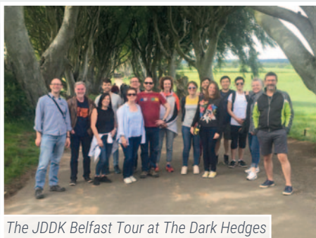
The JDDK Belfast Tour at The Dark Hedges

From there it was onto Carrickfergus Castle, the obligatory visit to the Dark Hedges, a superb avenue of ancient beech trees that featured in many episodes of Game of Thrones, and finished off the day with a visit to Bushmills Distillery.