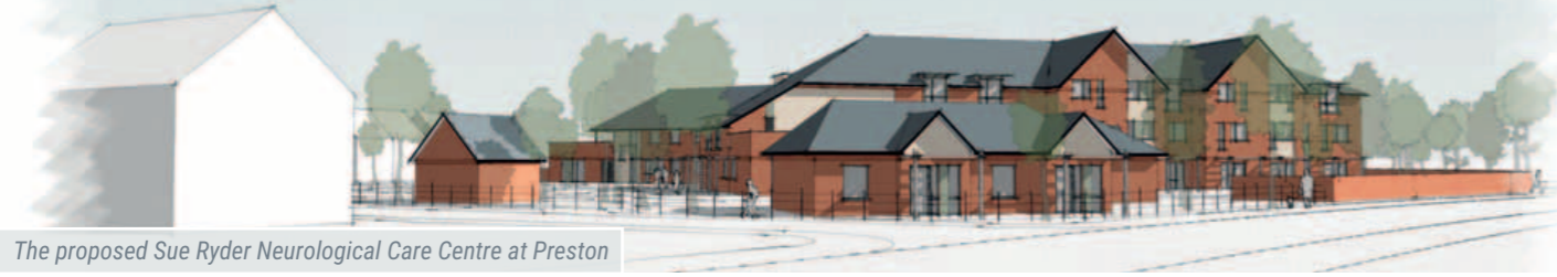
The proposed Sue Ryder Neurological Care Centre at Preston

In March we secured planning permission on behalf of Sue Ryder for an innovative Neurological Care Centre in the Eastway development area in North West Preston.