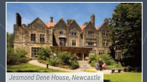
Jesmond Dene House, Newcastle