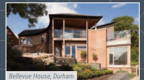
Bellevue House, Durham