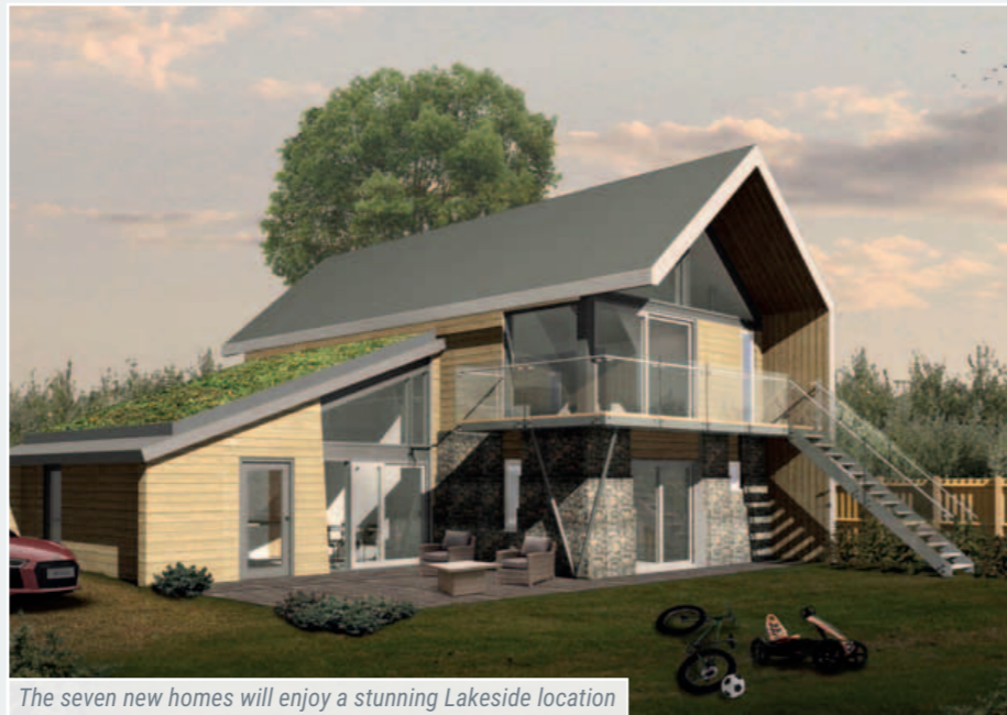
The seven new homes will enjoy a stunning Lakeside location

Located just to the South of the Rutherford Cancer Centre (see page 4), the four bedroom, two storey detached homes have been designed as an integral part of the overall vision for the Earth Balance site. This is to provide not only sustainable housing, but also training, education and employment during the construction phase. With their innovative Light Gauge Steel (LGS) frames, normally reserved for commercial construction projects, the project enables ORCA to engage and train unskilled workers in the off-site manufacturing, assembly and on-site installation of the structures.