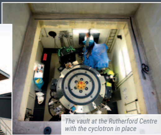
The vault at the Rutherford Centre with the cyclotron in place

Situated at the Earth Balance wellness site in Bomarsund, Northumberland, the site is the second to be built by Proton Partners International in the UK with construction work beginning in August 2016. The centre will be able to treat up to 500 patients every year and, in addition to proton therapy, will offer imaging, chemotherapy, traditional radiotherapy and well-being services. The centre is expected to open later this Summer.