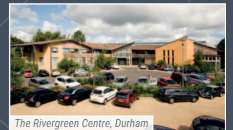
The Rivergreen Centre, Durham

"The site on Abbey Drive gives us a fantastic opportunity to provide high quality bungalows for which there is a strong demand in this area of Houghton Le Spring whilst the innovative design will create homes for life for the residents."