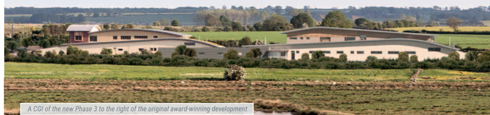
A CGI of the new Phase 3 to the right of the original award-winning development

Acting on behalf of our clients, Wear Referrals, we have applied for Planning Permission for a third phase of expansion to the Veterinary Hospital at Bradbury, near Sedgfield in County Durham.