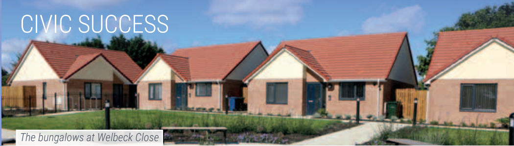
The bungalows at Welbeck Close

We were double winners at the prestigious Lord Mayor's Design Awards held on 30 January, winning both the Accessibility and Refurbishment categories with schemes to provide supported housing at Welbeck Close in Walker for Karbon Homes and the conversion of NBS's Old Post Office in Newcastle.