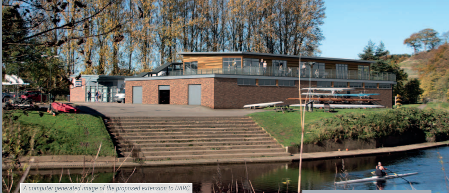
A computer generated image of the proposed extension to DARC