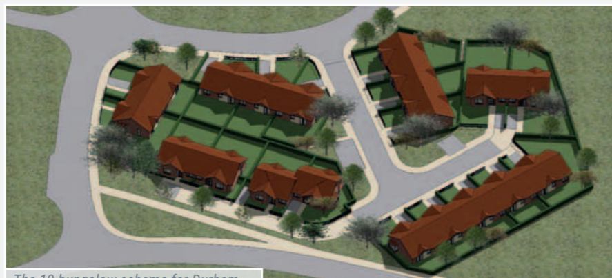
The 19 bungalow scheme for Durham Aged Mineworkers Housing Association

The layout of the Abbey Drive scheme has been orientated to give residents both security, with gable bay windows overlooking footpaths, and a 'green' feel with generous landscaping. Each bungalow enjoys its own private garden and dedicated parking bay in addition to areas of common amenity space.