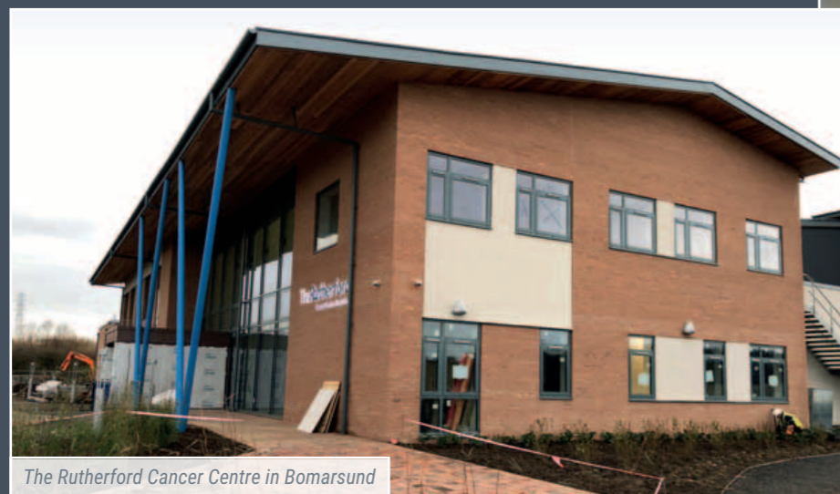
The Rutherford Cancer Centre in Bomarsund

February the 6th saw an important milestone at the Rutherford Cancer Centre in Bomarsund with the arrival on site of the 55 tonne cyclotron which generates the proton beams used in proton therapy. The therapy uses a high-energy beam of protons rather than x-rays to deliver radiotherapy for patients, reducing the risk of damage to the surrounding healthy tissues.