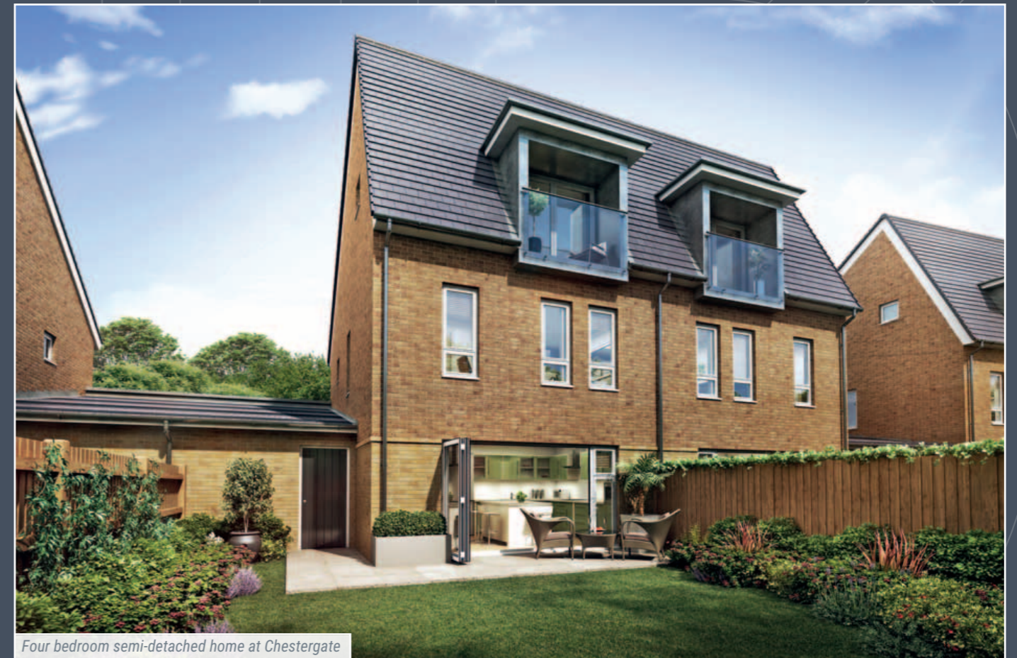
Four bedroom semi-detached home at Chestergate

Our planning application for phase one of a flagship housing development in Sunderland on behalf of Gentoo Homes was submitted in February.