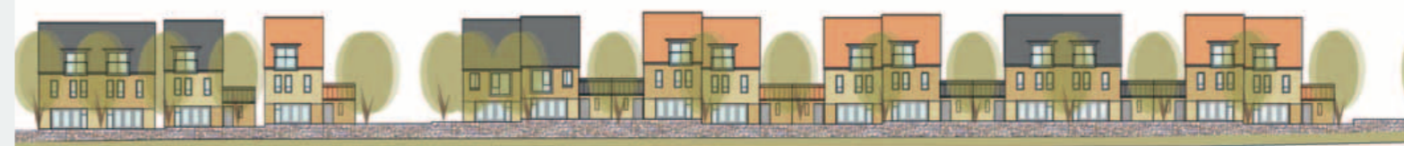
Proposed frontage to Chester Road

"We are hugely excited about the prospect of the new Chester Gate development and are immensely proud to play a key role in Sunderland's ongoing transformation in to a modern and prosperous 21st century city. "Our plans to redevelop the site represent a huge investment for Gentoo and this once again demonstrates our commitment to providing much needed new housing in Sunderland."