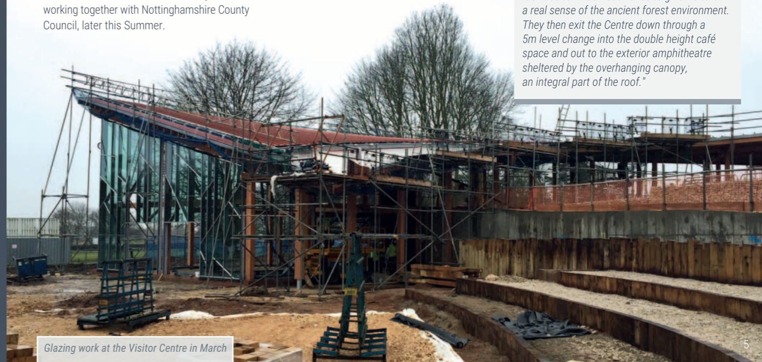
Glazing work at the Visitor Centre in March

"The linear format will pull visitors through the initial welcoming area for visitors into the main building with retail and recreation facilities to wilderness zones to give visitors a real sense of the ancient forest environment. They then exit the Centre down through a 5m level change into the double height café space and out to the exterior amphitheatre sheltered by the overhanging canopy, an integral part of the roof."