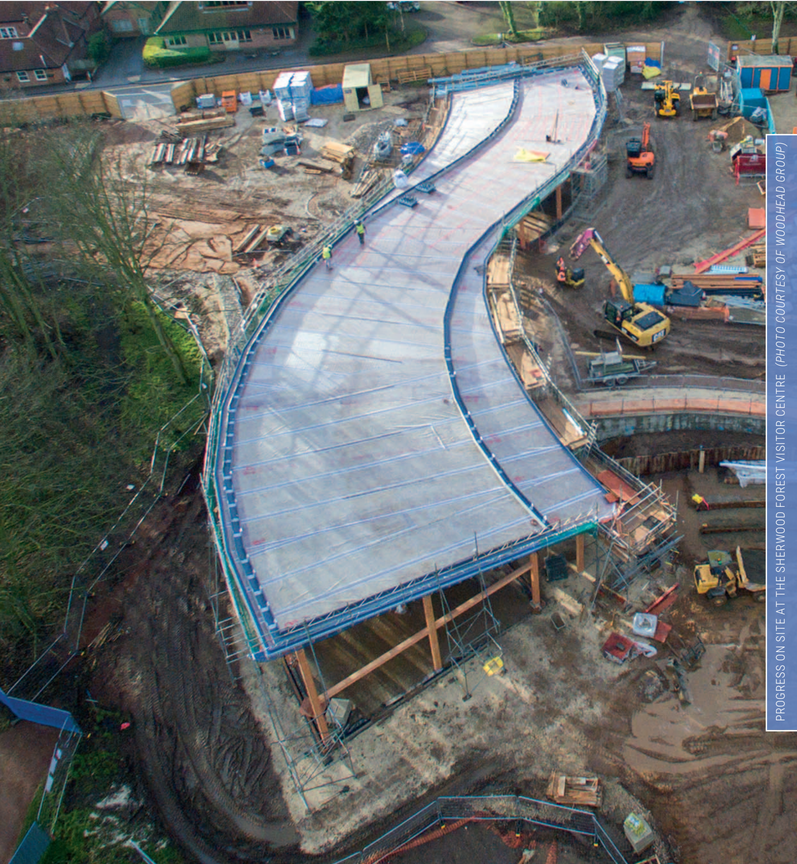
PROGRESS ON SITE AT THE SHERWOOD FOREST VISITOR CENTRE