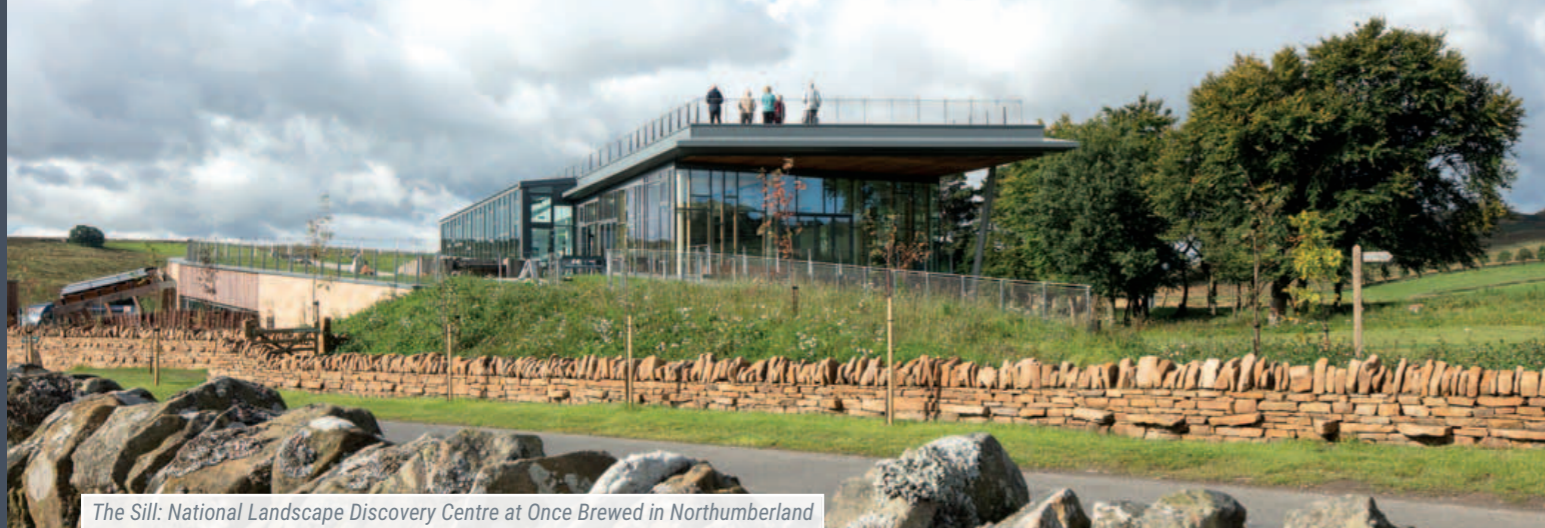
The Sill: National Landscape Discovery Centre at Once Brewed in Northumberland