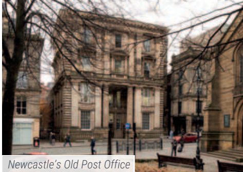
Newcastle's Old Post Office

Our design has returned the Grade II listed building to its original unified state creating space for NBS's 200