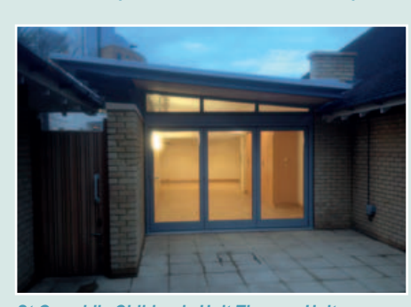
St Oswald's Children's Unit Therapy Unit.